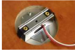
Rear view of installed fitting

Each fitting is supplied complete with mounting springs suitable for installation in plasterboard or wooden panel type surfaces, with shielded cable terminals.