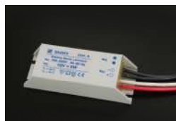
Cat.No. ZOL6 6W 10V Driver ZOL16 16W 10V Driver