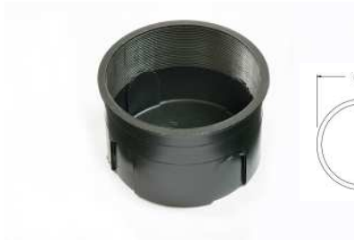
Cat.No. BOX60 Suitable for all sizes except “mini” versions

For added protection to cable connections to ZOL feeder/driver and for installation in solid surfaces, a recessing box is available. Mounting of fittings is effected by simply pushing the fitting into the box and allowing the spring clips to locate on the ribbed inner surface for a positive fit. Each box is provided with several “knock-outs” for cable entry.